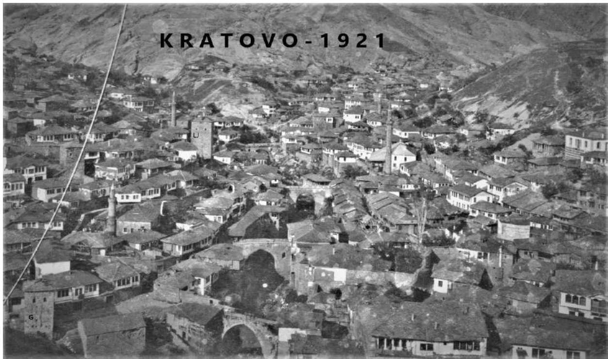
Kratovo